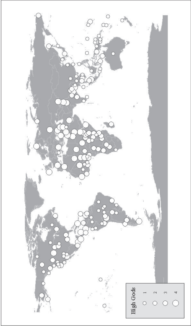
Figure 1. Distribution and coding of "high gods" across the Standard Cross-Cultural Sample (Murdock 1967). Coding levels are as follows: (1) absent or not reported; (2) present but not active in human affairs; (3) present and active in human affairs but not supportive of human morality; (4) present, active, and specifically supportive of human morality.